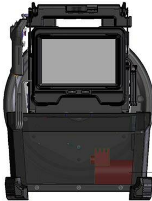
Built-in compact air compressor with anti-dust filter